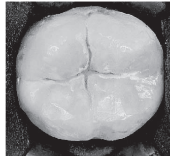
TOOTH BEFORE SEALANT APPLICATION

Sealants are very durable, and in most cases, hold up for several years. Everyone is different, however, and sometimes sealants need to be reapplied. Your dentist will check them at every visit.